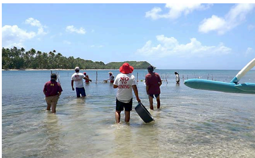
© ← Seaweed Farmers, Gibusong Island, Dinagat Islands province. © Rappler

The Philippines is one of the world's largest producers of nickel ore. 3 It is also the world's leading supplier of nickel ore to China, where it is used in the production of stainless steel and in other industrial applications. 4 Approximately 90% of all nickel mined in the Philippines is exported to China, with the remainder exported to Japan. 5