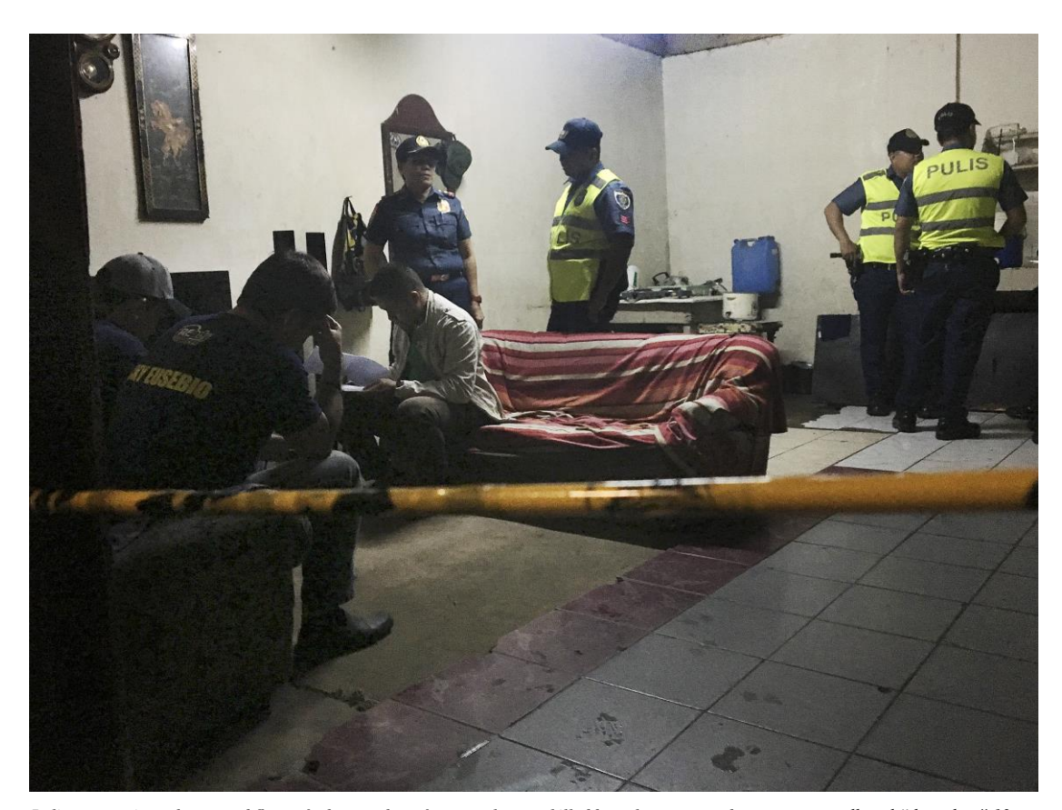
Policemen wait on the ground floor of a house where four people were killed by unknown armed persons in an alleged "drug den," 12 December 2016, Pasig City, Metro Manila. Crime scene investigators had not arrived yet to work the case—one of two incidents documented by Amnesty International delegates observing journalists' night-shift coverage of police activities.

Many killings by unknown armed persons are shockingly brazen. In a town in Cotabato Province, a witness interviewed by Amnesty International watched as a friend was killed in November 2016 while working at a cafeteria outside a local school. Students were packed in for the lunch hour, as the assailant pulled out a gun. The witness recalled thinking she "was in a movie, I thought it was a joke, that it was a toy gun. The gunman put the gun to the back of [his] head. ... Then there was a loud sound. It sounded like a firecracker." <sup>214</sup> As the children screamed, the paid killer left with a companion on a motorcycle.