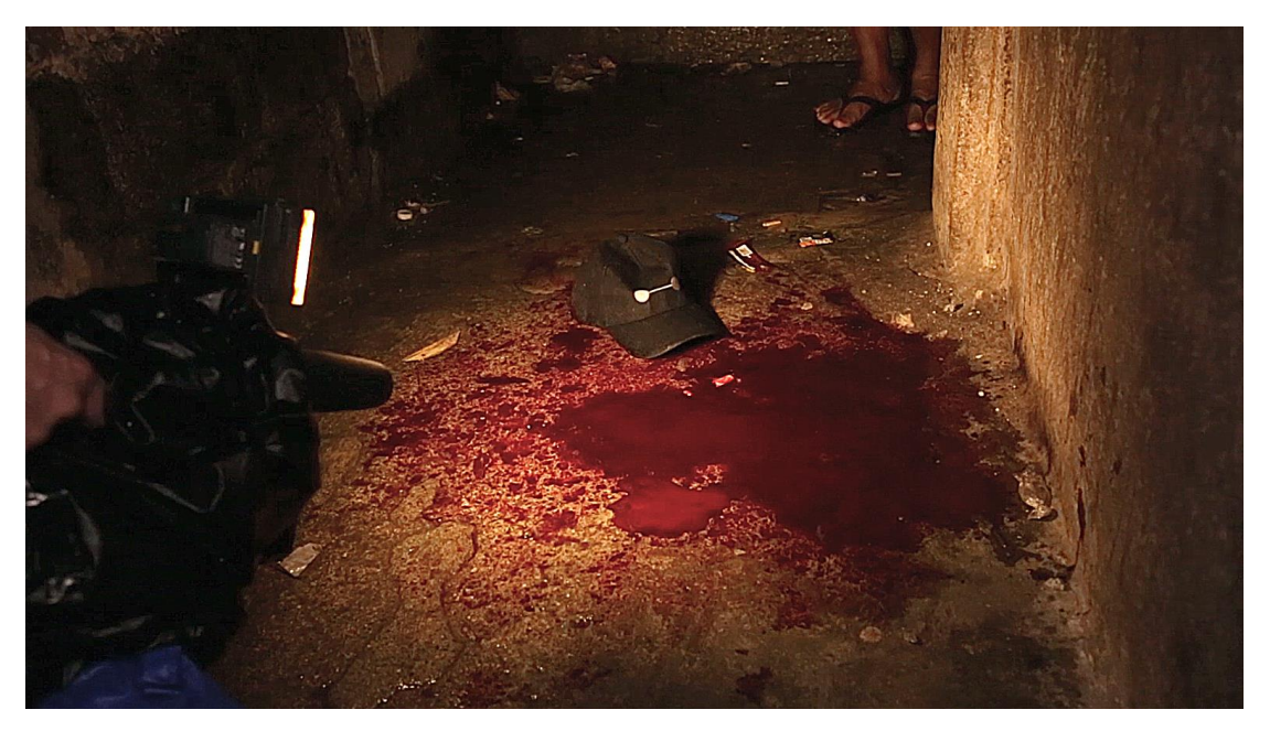
A pool of blood is filmed by a cameraman following a killing on 12 December 2016, Caloocan City, Metro Manila. The killing in a police "buy-bust" operation was one of two cases documented by Amnesty International delegates observing journalists' night-shift coverage of police activities. Screengrab, © Amnesty International (photographer Alyx Ayn Arumpac)

Of the 33 drug-related killings documented by Amnesty International, 20 occurred during formal police operations. The vast majority appear to have been extrajudicial executions.