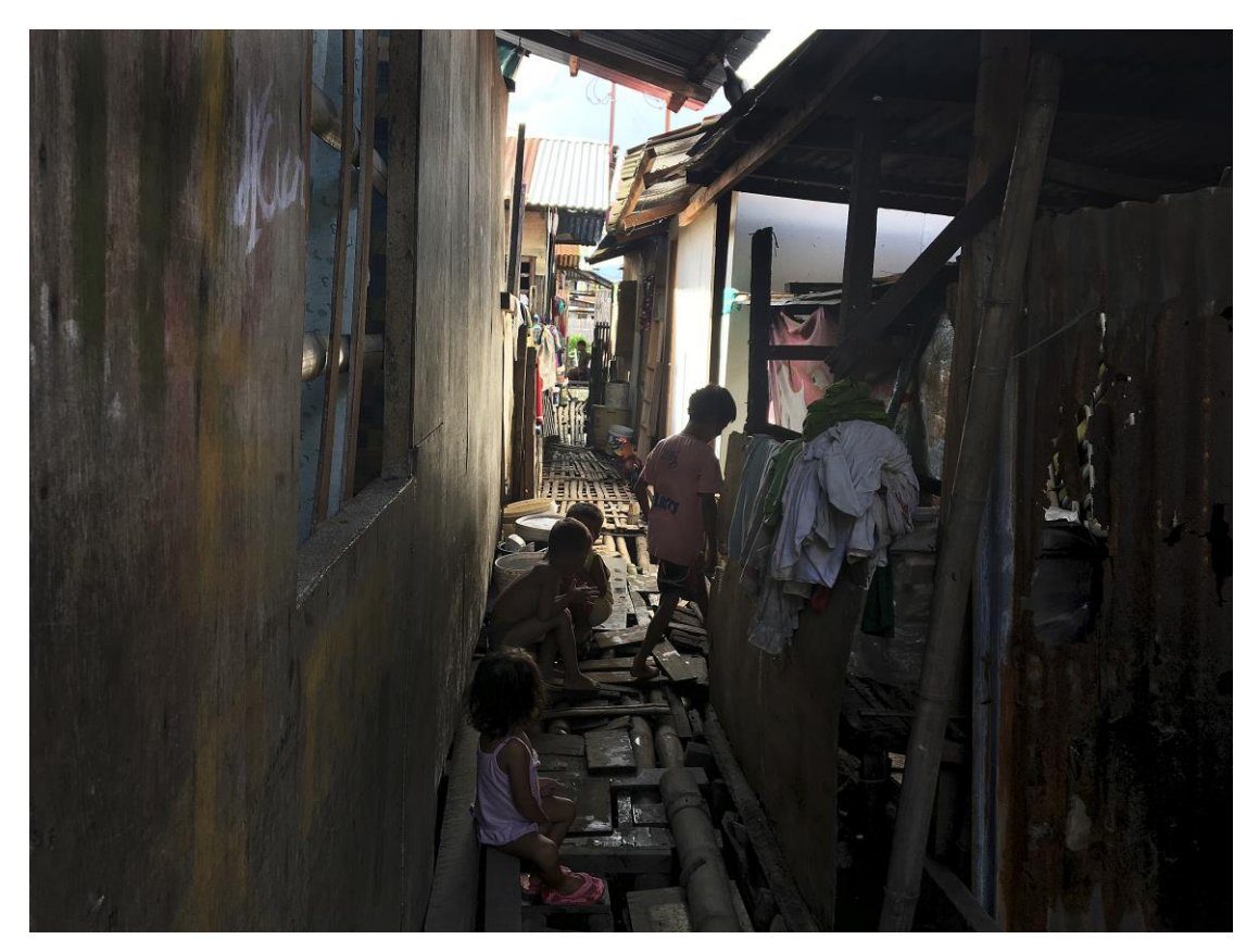
Children play, 8 December 2016, in a floating slum (exact location withheld) where one of the cases of killings by police documented by Amnesty International in Cebu Province took place. Many of the people who have been targeted in the anti-drugs campaign are poor.