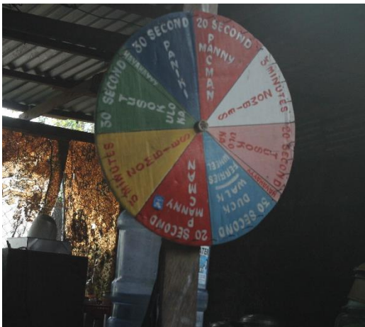
Fig. 4 – A "wheel of torture" at an undisclosed police safe house in Laguna province, south of Manila, Philippines.

In January 2014, the Philippines' Commission on Human Rights (CHR) exposed a secret detention facility in Laguna, a province south of the capital, Manila, in which police officers appeared to be torturing detainees for entertainment. The CHR found a large roulette wheel on which were written descriptions of various torture positions. If the wheel was spun and landed on "30 second bat position", for example, this meant that the detainee would be hung upside down (like a bat) for 30 seconds. "20 second Manny Pacquiao " meant that a detainee would be punched non-stop for 20 seconds. The existence of such a device, apparently for police officers' entertainment, clearly demonstrates the casual attitude towards torture within the police force.