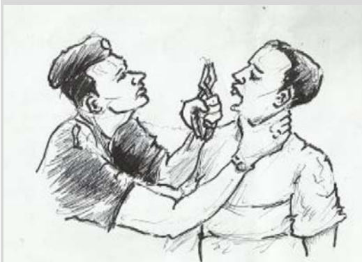
Figure 2 - An artist's drawing portraying a tooth being extracted by a police officer. © Chijioke Ugwu Clement