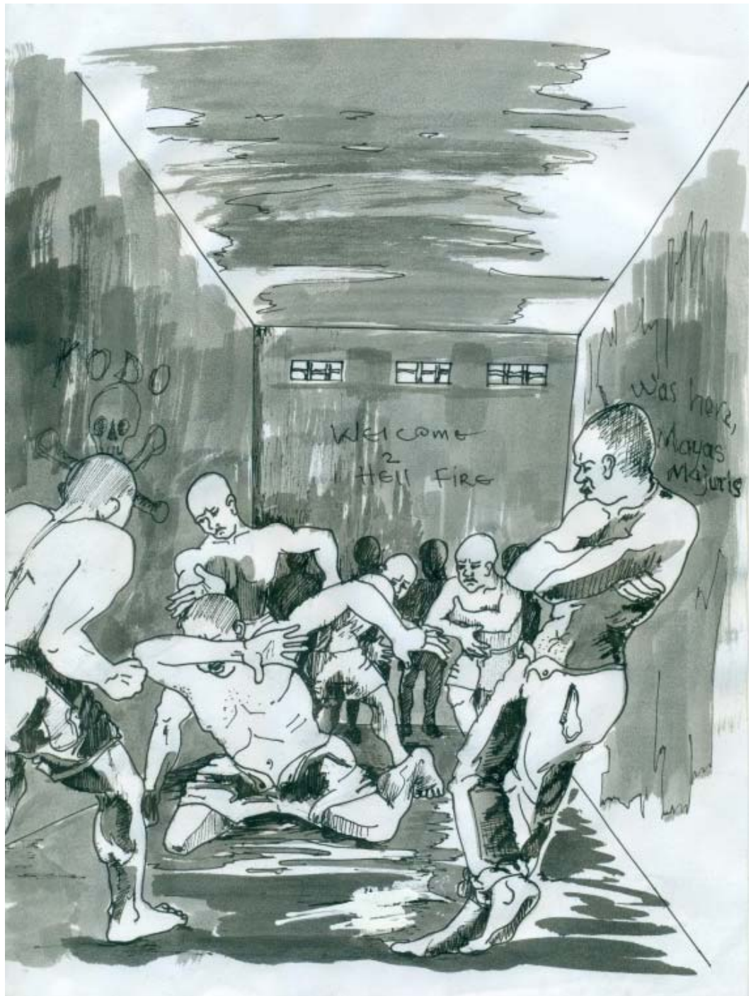
Figure 9 - An artist's drawing depicting Chinwe's account. © Chijioko Ugwu Clement