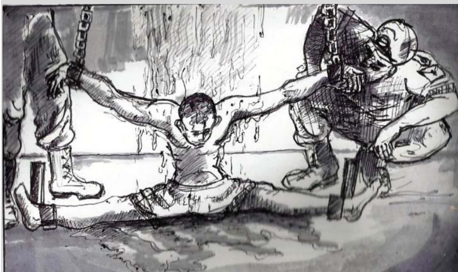
Figure 5 – An artist's drawing portraying 'water torture'. © Chijioko Ugwu Clement

Some former detainees have also described other forms of abuse that may violate the absolute prohibition of torture and other ill-treatment, including experiencing mock executions and being forced to watch other people being extrajudicially executed. As a result of increased scrutiny by human rights non-governmental groups, Nigerian human rights organizations have reported new methods of torture aimed at hiding visible marks on the body of victims. This include covering the ropes used in tying up suspects with cloth to avoid any mark on the body; and tying the upper arm of suspects with rubber to choke the flow of blood and covering detainees with plastic and placing them in the sun until they die.