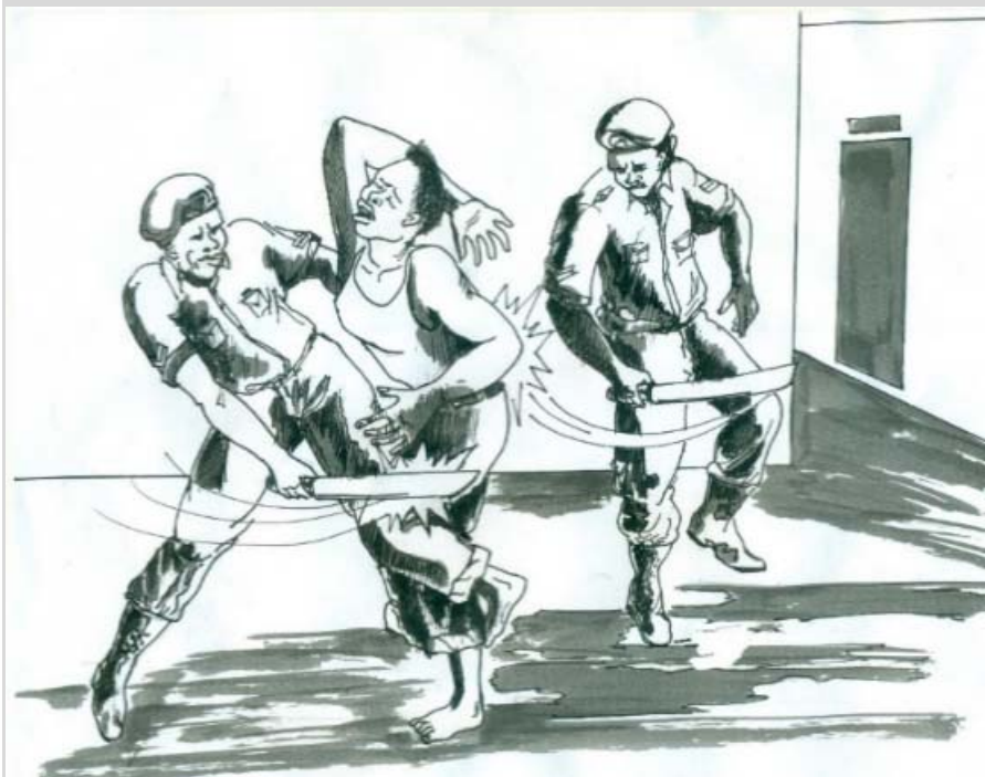
Figure 1 – An artist's drawing portraying a beating with machetes. © Chijioke Ugwu Clement