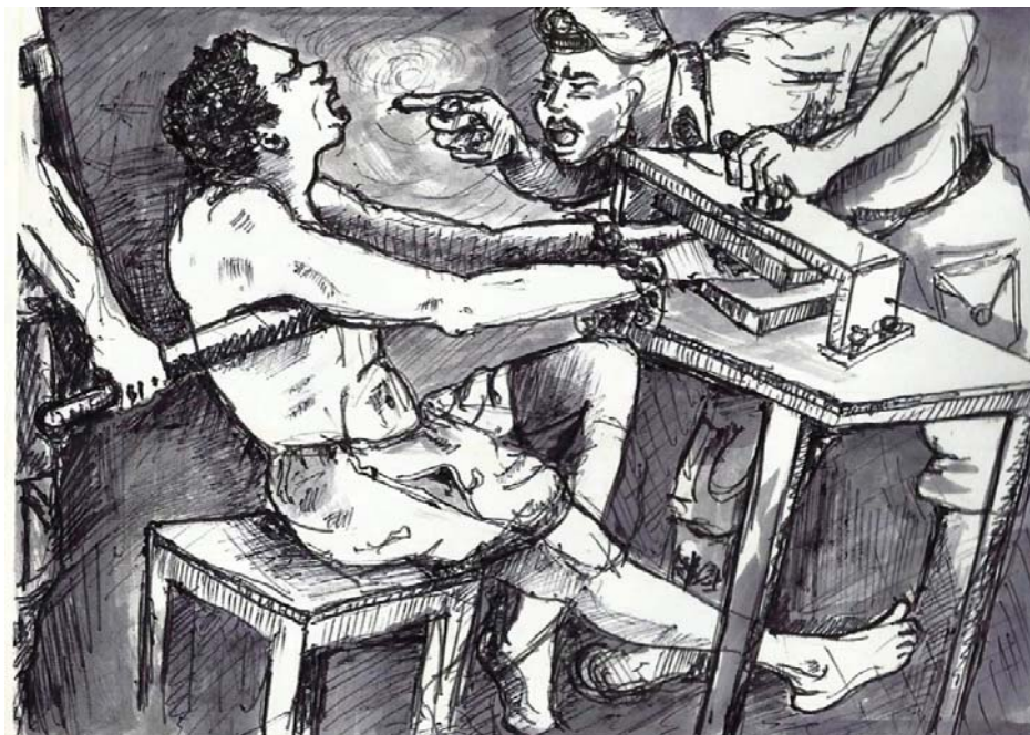
Figure 10- An artist's drawing depicting an interrogation. © Chijioke Ugwu Clement

in connection with serious crimes such as armed robbery or murder are particularly at risk of being tortured to extract confessions, as the police are under pressure to solve such cases.