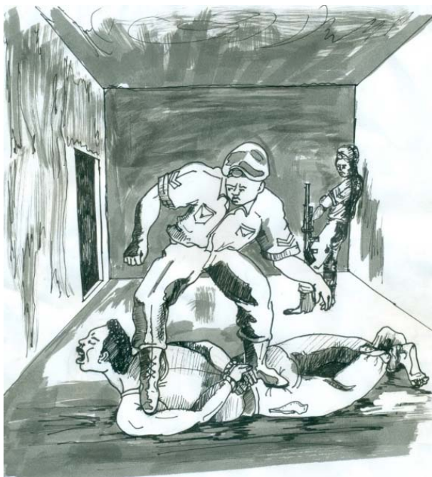
Figure 6 - An artist's drawing depicting Ahmed's account. © Chijioke Ugwu Clement

Many of my colleagues did not make it [died in detention]. The beating, the torture was just too much for us. They do all types of things to you, the soldiers. They will tie your hands behind your back, with the elbows touching and then one of them will walk on your tied hands with their boots. Your hands will remain tied and then they'll pour salt water on your wounds. You can't rub it, even if it goes into your eyes. My eyes got swollen as a result of that. I thought I was going to be blind. I have never experienced such brutality in my life." 23