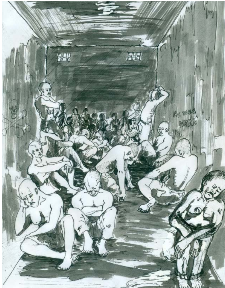
Figure 11 - An artist's drawing depicting Mustafa's account. © Chijioke Ugwu Clement

Conditions in detention facilities in Damaturu are also poor, and appear to amount to ill-treatment. Most of the detainees are kept at 'Sector Alpha' which consists of shops that were deserted and are now being used to detain people – there are no toilets or proper ventilation. Consistent accounts recorded by Amnesty International suggest that up to 50-70 people are put in cells that can only fit about five people. Conditions are marginally better at the Presidential Lodge ("guardroom") also in Damaturu where detainees are kept in rooms that have been created by dividing a former squash court. About 15-20 people are kept in a room of 15 x 20 feet, but detainees are allowed to move around in the corridors during the day. There are also some toilets for common use at the end of the corridor.