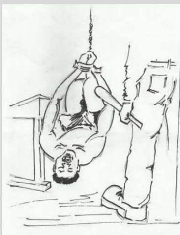
Figure 3 - An artist's drawing depicting a detainee being suspended upside down by their feet. © Chijioke Ugwu Clement