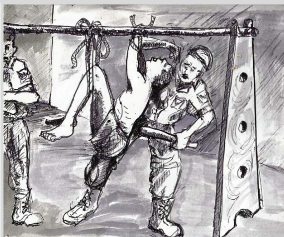
Figure 4 - An artist's drawing depicting the suspension of a detainee from a rod. © Chijioke Ugwu Clement